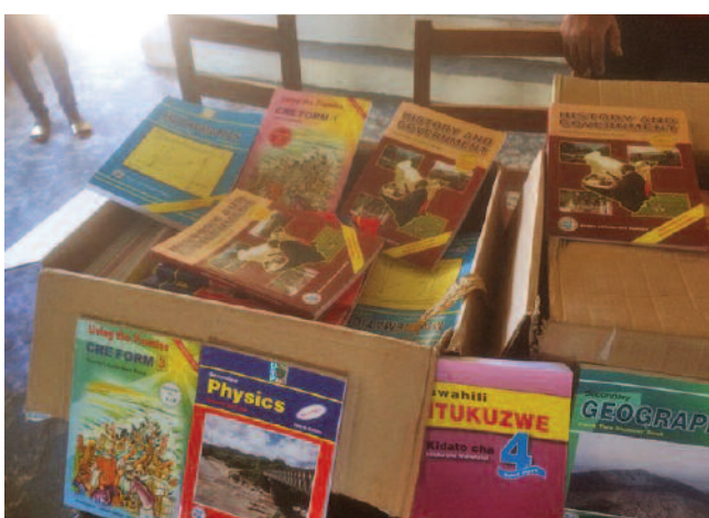
Die neue Schullektüre