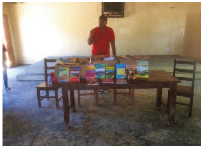
Schüler und Lehrer sind froh über den neuen Lernstoff.